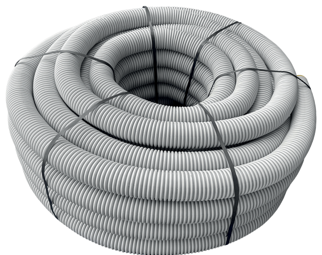
QV90P-HP Quiet-Vent 90mm x 50 Metre Antibacterial Radial Pipe